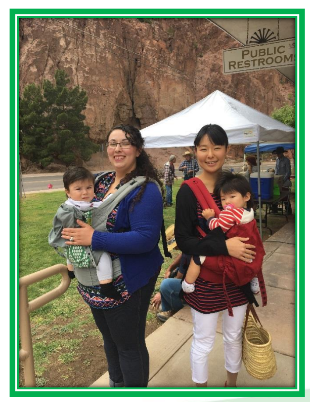
GREENLEE COUNTY Community Health Improvement Plan 13